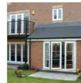
Expertly crafted, a Lifestyle bi-fold door blends confidently into its environment