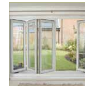
Our bi-fold doors are manufactured with a slim, square edge door profile, to achieve attractive looks and maximum glass area