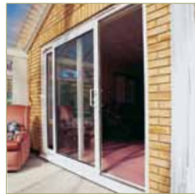
Ideal for rooms leading into a conservatory