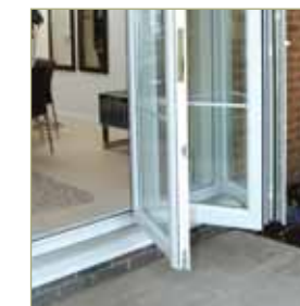
Extensive openings up to 6.5 metres wide maximises ventilation and natural light for a fresh and healthy environment