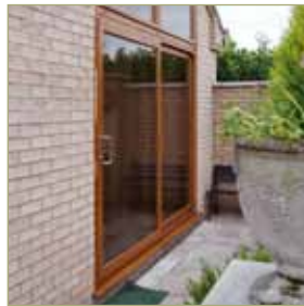
Patio doors are perfect for leading into your garden space

Available in a range of colours such as classic cream or traditional timber appearance, you can select a different interior colour to blend with your interior décor.