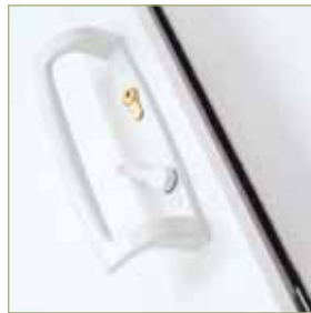
Available in a range of stylish handle options