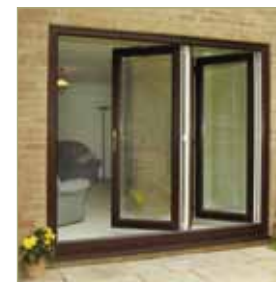
Stunning designs and the feeling of more space will enhance your lifestyle and improve the value of your home

With a choice of contemporary colours and styles, you can create a look that is perfect for your home. Whether you want to match your existing décor, or make a stylish contrast, our doors offer the ultimate walkway from indoor to outdoor living.