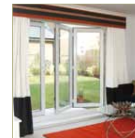
A choice of fold options and opening styles means your door can be tailored to suit you