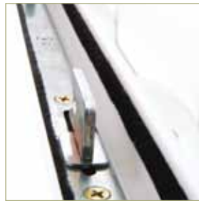
Featuring the latest high security locking systems