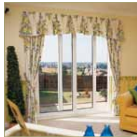
Patio doors increase natural light into your room